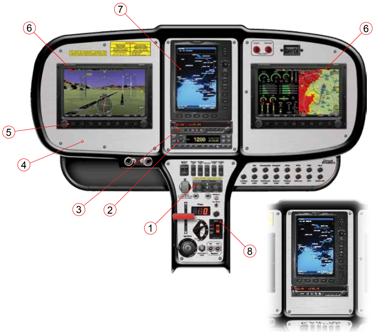
Center Panel Equipment Option – Depending on Certification Basis