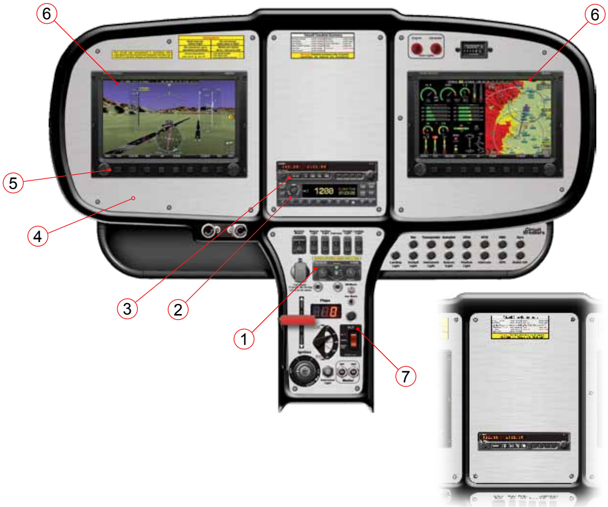
Center Panel Equipment Option – Depending on Certification Basis